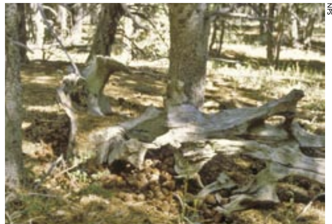
Grizzly bears depend on red squirrels to harvest and cache whitebark pine cones.

Whitebark pine nuts are by far the most important plant food eaten by the park's grizzly bears. The pine nut story is particularly interesting, in that grizzly bears depend on small red squirrels to harvest the cones and bring them down to the ground where bears can feast. When pine nuts are abundant, bears tend to be in the high-elevation areas where whitebark pines grow and are, thus, far from human developments and conflict. In years of pine nut failure, grizzly bear mortality can