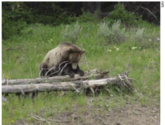
A grizzly bear rips open a log to feed on the ants inside.