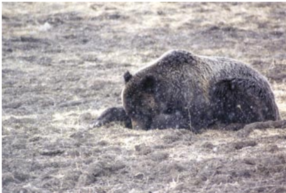
This grizzly bear is digging for pocket gophers and their food caches. GPS collars, hair snares, isotope analysis, and DNA are being used to gain insights into the nutritional ecology of bears.