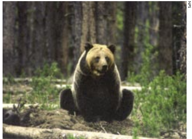
A bear defends a bison carcass from other scavengers. Meat provides approximately 80% of adult male grizzly bears' annual nourishment in Yellowstone National Park.

Glacier National Park and Denali National Park, where plant matter provides 97% of their nourishment (Table 1). Thus, for grizzly bears, the opportunity to consume meat differentiates the Yellowstone ecosystem from many other interior ecosystems where bears must feed primarily on plants. Cutthroat trout are one of those meat sources.