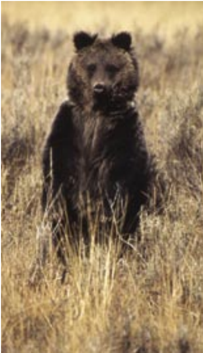
GPS collars allow scientists to pinpoint grizzly bear feeding sites.

when bears are not denning. Known as Bear Management Areas, these closures were intended to eliminate human entry and disturbance, prevent human–bear conflicts and habituation of bears to people near prime food sources, and provide places where bears can pursue natural behavioral patterns and social activities. Four areas around Yellowstone Lake where grizzly bears are known to forage for fish are closed during the trout spawning season. Over the years, the park has received challenges to these closures, with specific requests to open such areas to human entry. Given the reduced abundance of fish around Yellowstone Lake, we hypothesize that Yellowstone bears are far less likely than those observed in Alaska to voluntarily leave important, high-quality food resources due to the presence of people and therefore the potential for bear–human conflict is real.